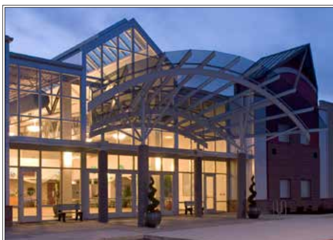
Korean Community Presbyterian Church