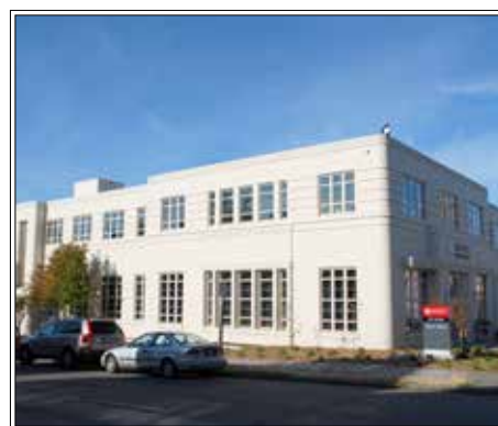
Seattle University 1313 E. Columbia Building