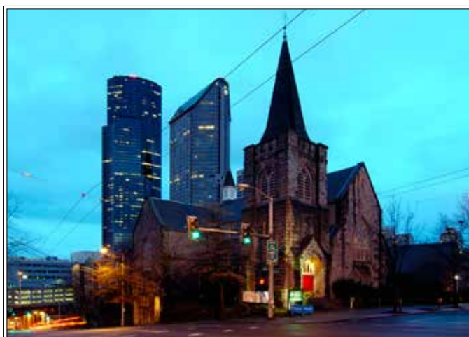
Trinity Parish Church