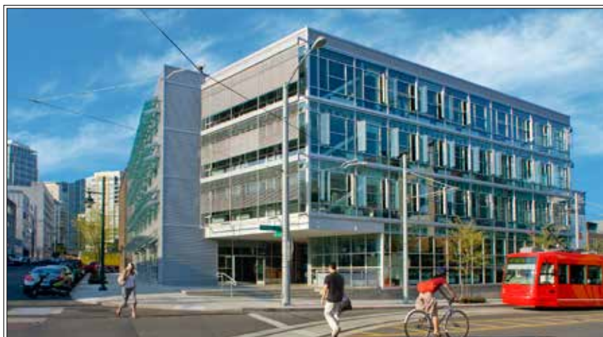
Terry Thomas Office Building

But more than anything, what distinguishes us is our integrity. That's why we have such loyal clients. That's why we have loyal employees. And that is why I'm here, too. I'm proud of the work we do, but I'm most proud of the people that make it happen. They are the Rafn Company."