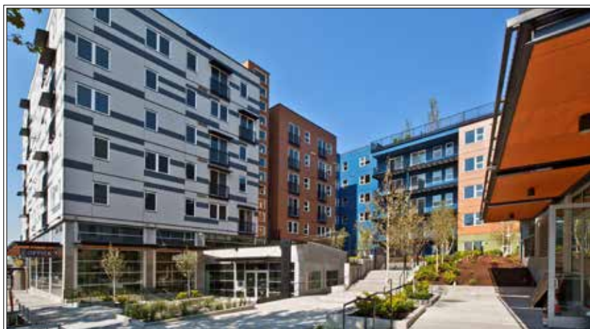
AMLI Mark24 Apartments

We are a group of people who share our knowledge and experience in a way that brings you the very best collective thinking. That team spirit as well as Rafn's core values of fairness, honesty and integrity brings success to every relationship. We are committed to celebrating every project as a winner and every customer as a friend. I can't imagine a better place to work or better people to work with."