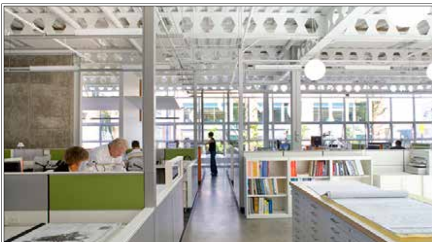
Weber Thompson Office TI (LEED Platinum)

That's why it's satisfying to work at the Rafn Company which places environmental responsibility, sustainable building techniques and conservation for future generations ahead of self interest.