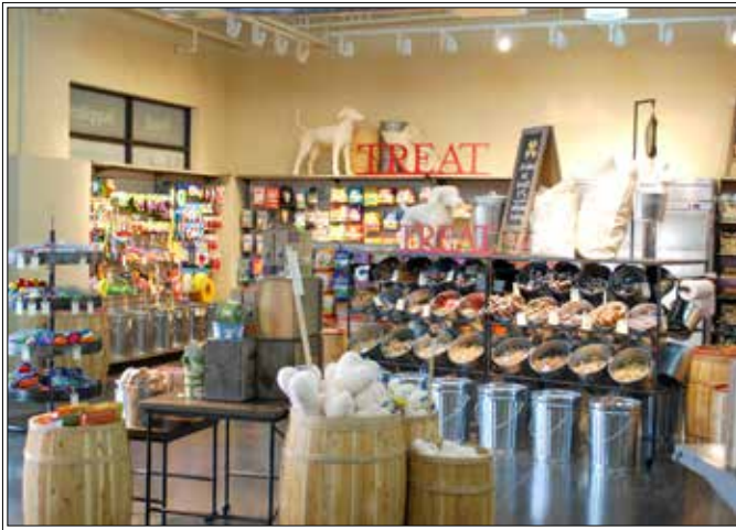
Mud Bay - Redmond Store