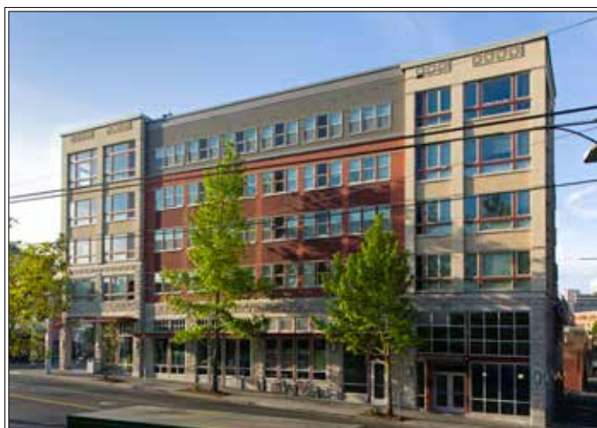
Broadway Crossing Apartments