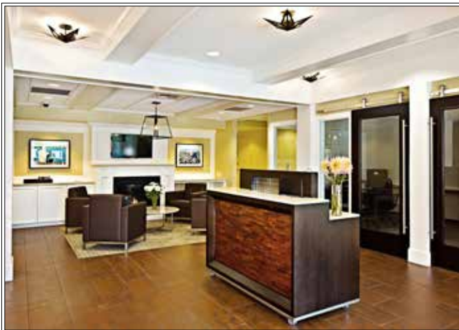
HomeStreek Bank - Madison Park Branch