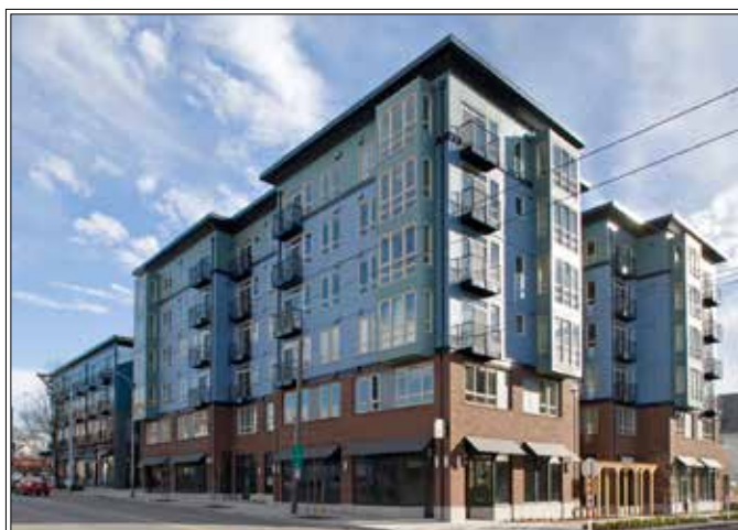
The Heights on Capitol Hill Apartments