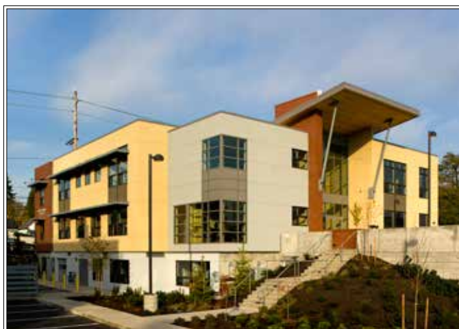
Kitsap Community Resources Office Building