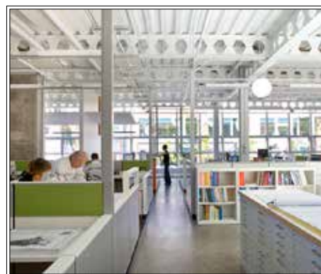
Weber Thompson Office TI