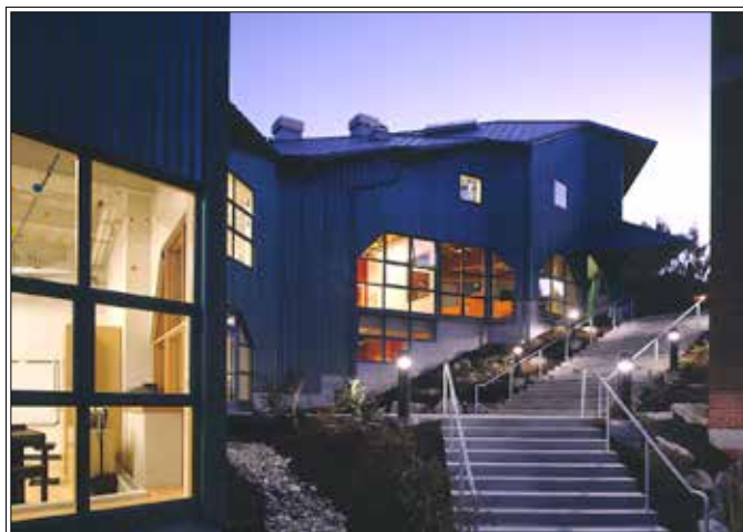
University Child Development School