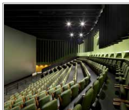
Pacific Science Center - PACCAR IMAX Theater