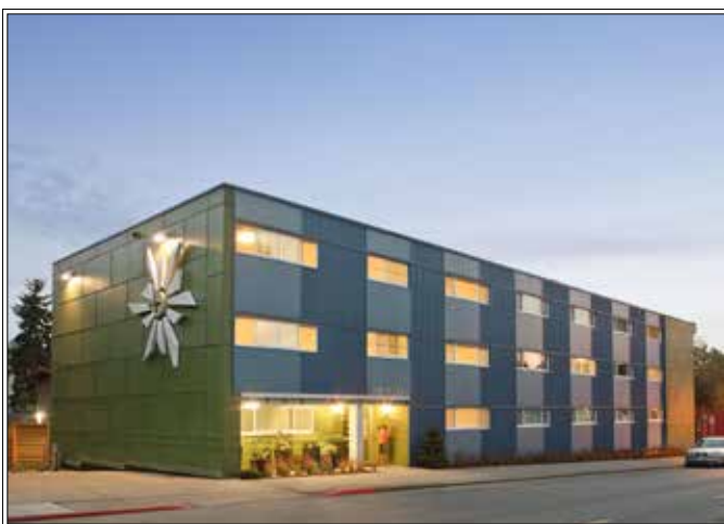
Holiday Apartments Renovation