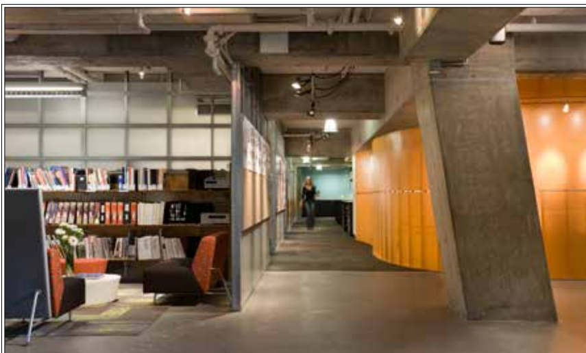
GGLO Architects Office

Trust your next project to the Special Projects Group at Rafn. The results will impress you."